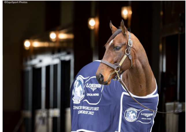
Flightline, with a rating of 140, was named the 2022 Longines World's Best Racehorse

Undefeated, Flightline retired to Lane's End at the end of the year.