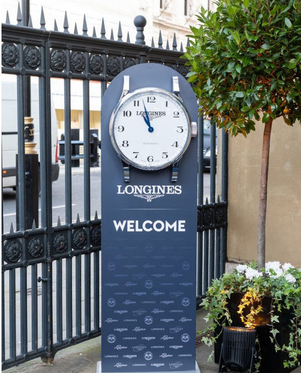
The 2022 Longines World Racing Awards were held in London this January