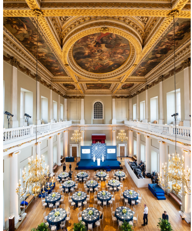
The event took place at Banqueting House, which is one of the Historic Royal Palaces