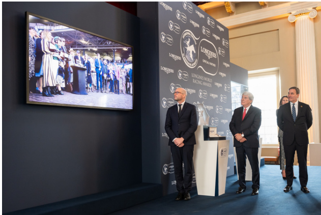
The Longines Breeders' Cup Classic (G1) was revealed as the 2022 Longines World's Best Horse Race