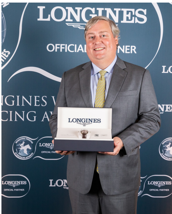
The Longines Breeders' Cup Classic was named the 2022 Longines World's Best Horse Race

"Clearly, running the 2020 event without fans at Keeneland was a choice we did not want to make, but it was vital to put the health and safety of both fans and participants first," he said. "We