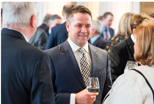
Famous footballer and racehorse owner Michael Owen was among those in attendance