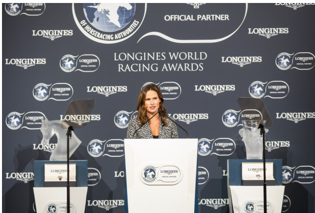
Internationally renowned presenter Francesca Cumani served as the emcee of the ceremony