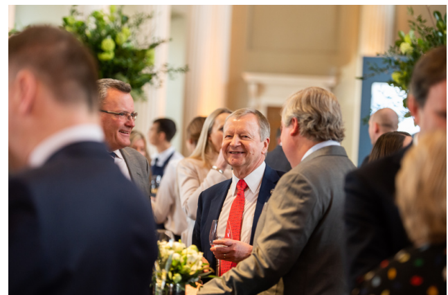
A memorable event at a memorable venue