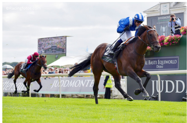
Baaeed was rated at 135, making him the highest rated turf horse in 2022