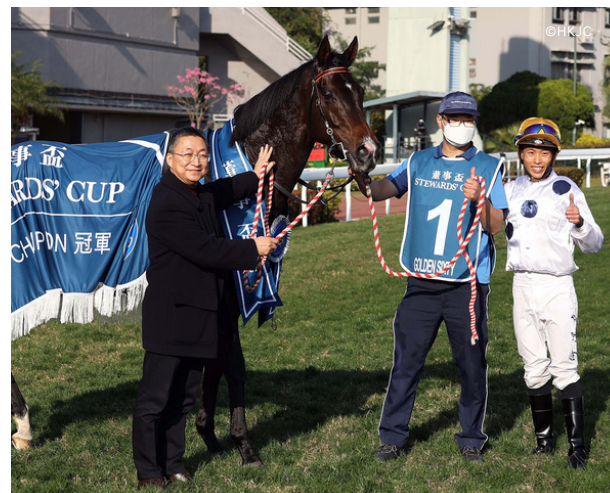
Golden Sixty has been a stalwart of the rankings for four years

The next edition of the Longines World's Best Racehorse Rankings will be published on Thursday, 13th April.