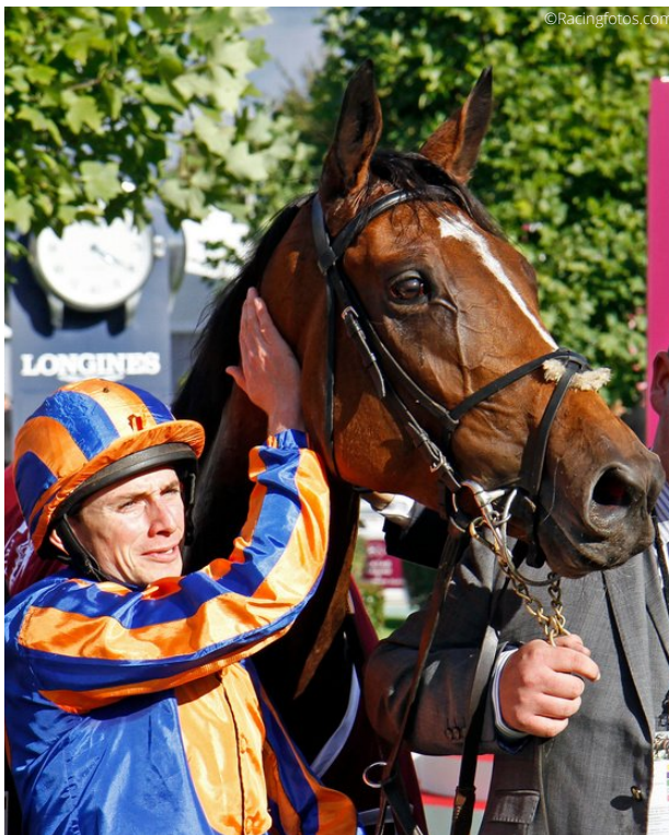
Snowfall is closely related to 2016 Arc heroine Found