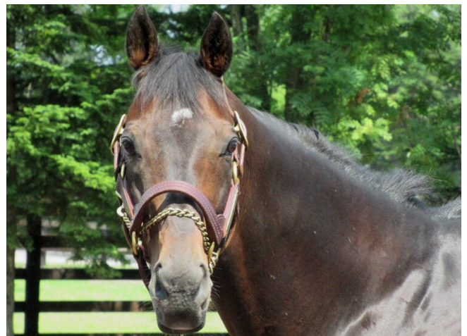
The legendary Deep Impact died in 2019. Is Snowfall his magnum opus?

For fans at home in Japan, Green Channel and other terrestrial TV will have live coverage of the Arc, and the expected number of viewers is in the millions. Should one of the Japanese-bred winners take the 100th running of the Arc, it will be a historic day on many levels.