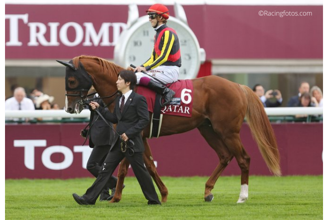
Japan's Orfevre broke more than one heart when he finished second in the Arc - twice.