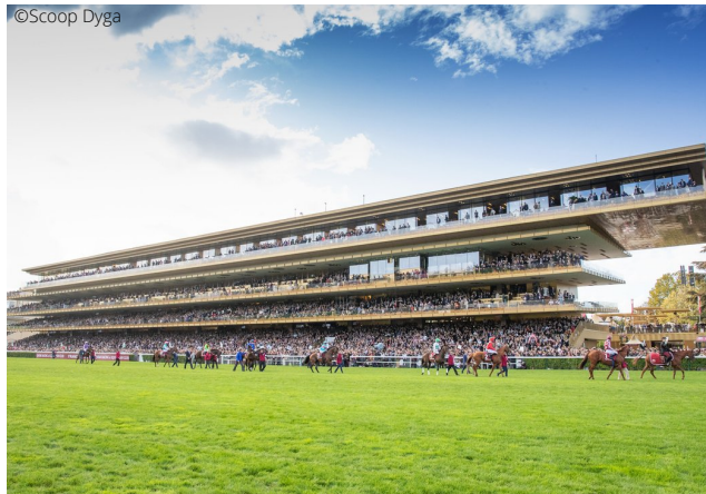
ParisLongchamp is the home of the historic Prix de l'Arc de Triomphe

Because since 1920 any claims to greatness, over a mile and a half on turf, will nowhere be carved more persuasively than in the Longchamp pantheon.