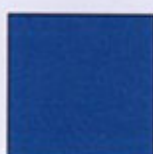
16. ROYAL BLUE Pantone No: 293