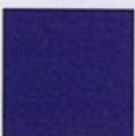
14. PURPLE Pantone No: 2607