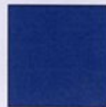
4. DARK BLUE Pantone No: 2767