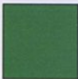
6. EMERALD GREEN Pantone No: 354