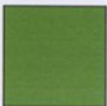
9. LIGHT GREEN Pantone No: 369