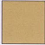
1. BEIGE Pantone No: 4525