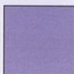
11. MAUVE Pantone No: 2567