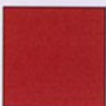
10. MAROON Pantone No: 201