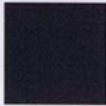
2. BLACK Pantone No: 433