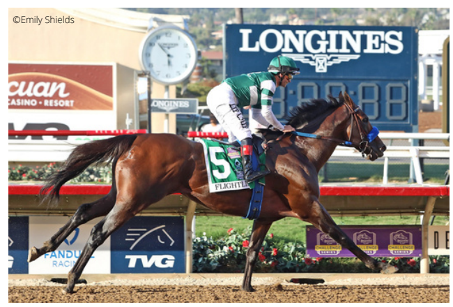
Flightline has a rating of 139, making him the highest rated horse in the world

A: You're always unsure going into the race when you are trying something new, but after being at his Saturday morning workouts and how easily he was handling the extra distance, we were very pleased with his performance. You never expect to win by 20 lengths, but Flightline is something special that we haven't seen in our industry in a very long time.